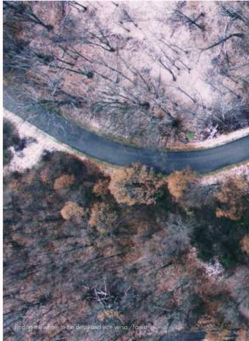
Finding the whole in the detail and vice versa./Forest

The Automatic Exchange of Information requires the import and the processing of a tremendous amount of data. Depending on the size and customer characteristics of a bank, the number of reporting-relevant accounts and transactions can easily be several millions. These numbers can even be higher for international banking groups. Performance-optimised processing is therefore an absolute necessity. On the other hand, financial institutions are faced with the requirement to control and analyse the data volumes fast and in an efficient way and to make data available for other use cases, like audits, reconciliation, and business intelligence or management reports.