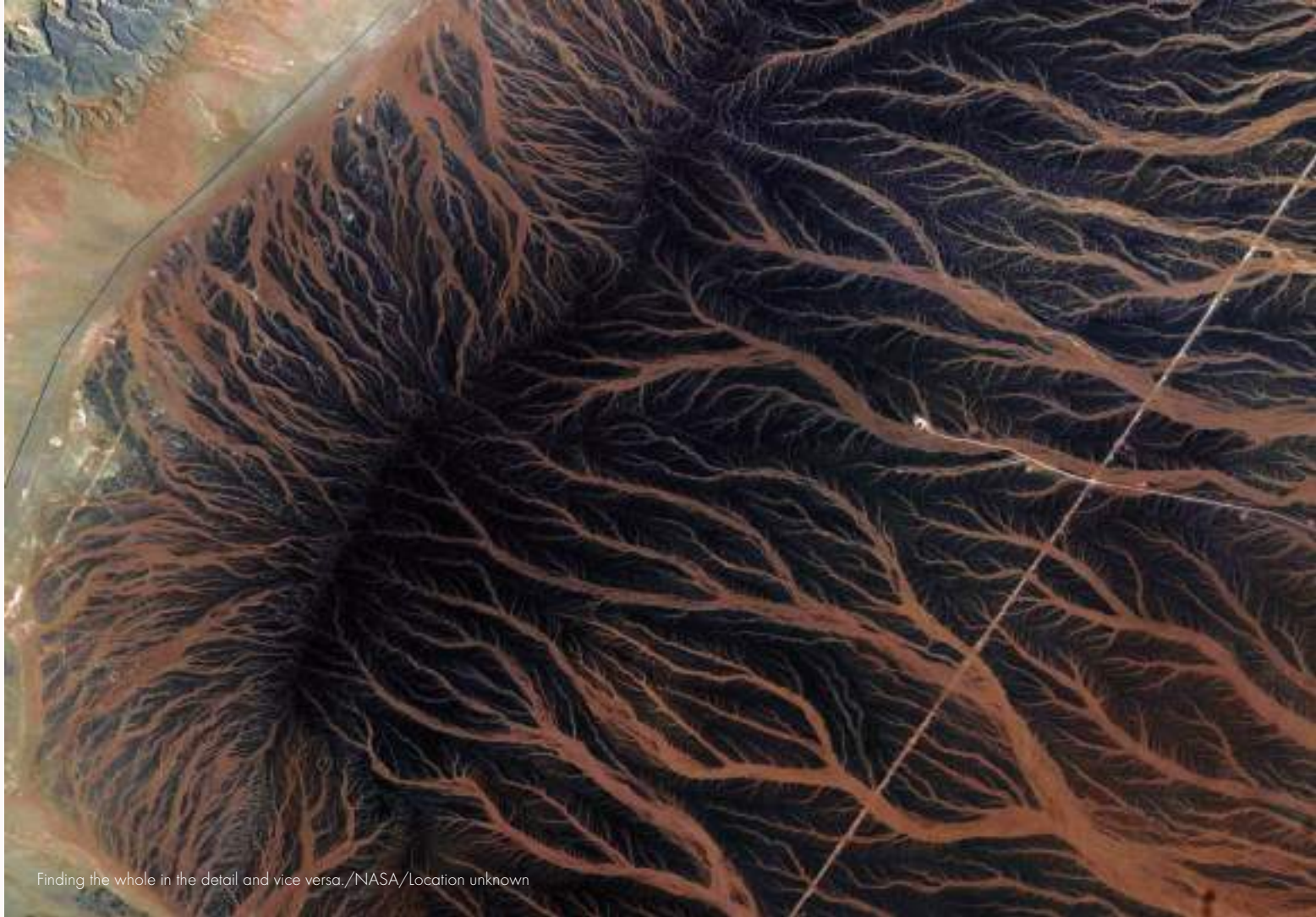
Finding the whole in the detail and vice versa./Location unknown