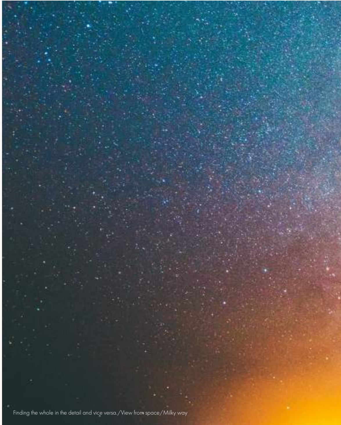
Finding the whole in the detail and vice versa./View from space/Milky way

SDS GEOS supports for international requirements and long-term use in multinational banks.