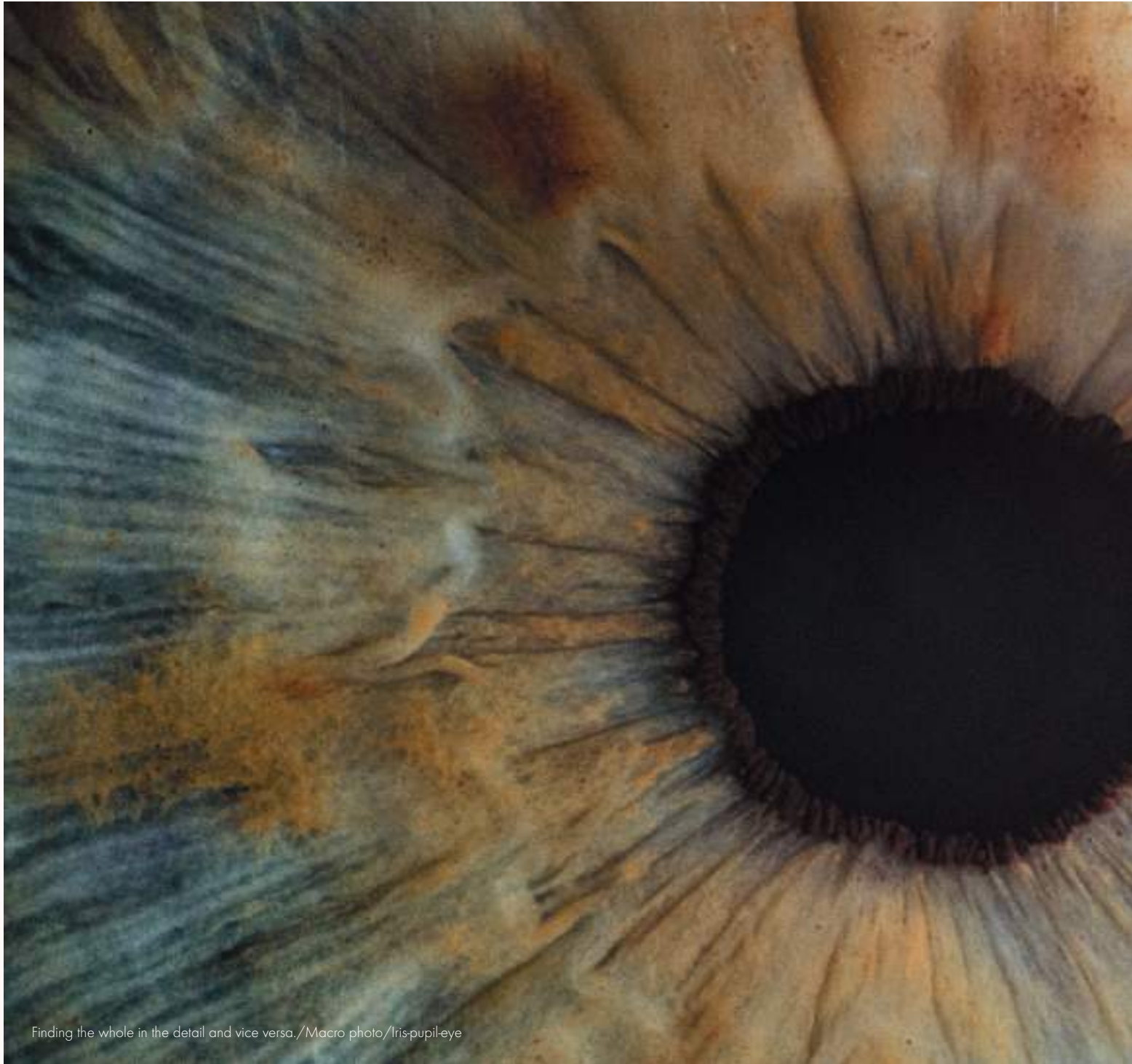
Finding the whole in the detail and vice versa./Macro photo/Iris-pupil-eye