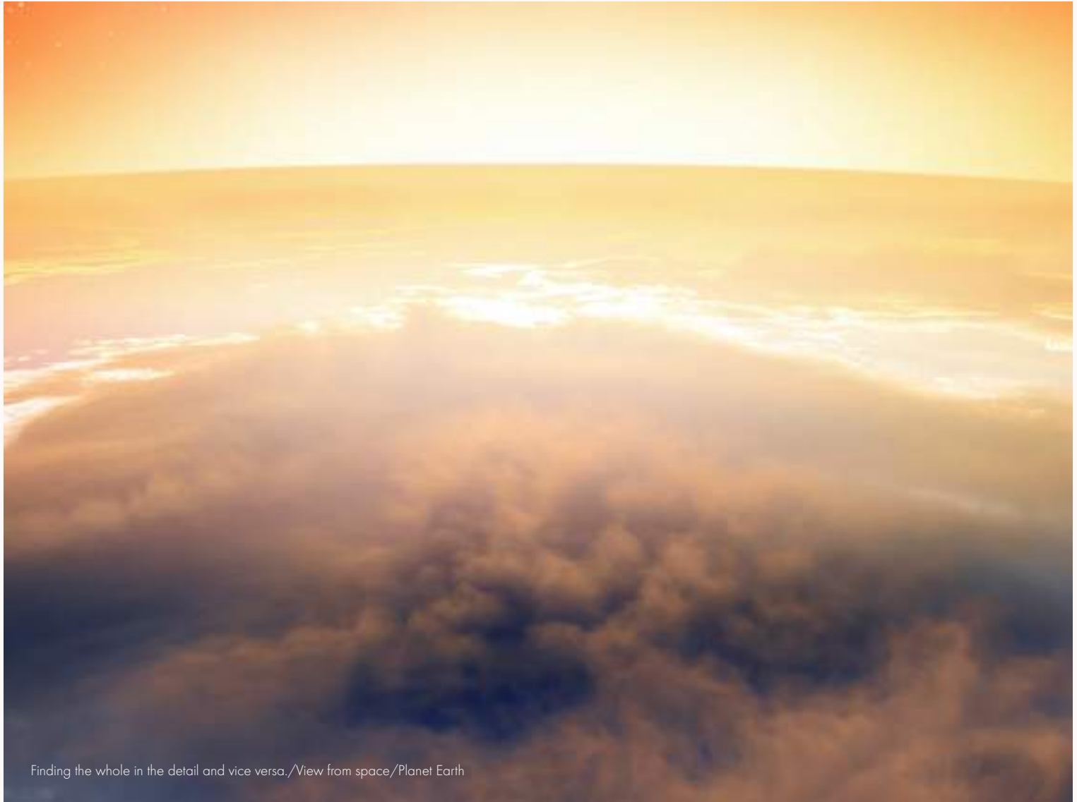
Finding the whole in the detail and vice versa./View from space/Planet Earth