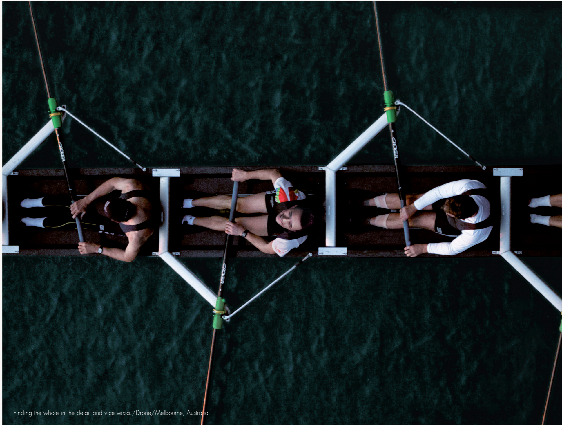
Finding the whole in the detail and vice versa./Drone/Melbourne, Australia

SDS is continuously setting digital standards in financial market operations, regulations and compliance solutions for the international financial industry. The comprehensive SDS portfolio covers state-of-the-future products and services for all customer and market-related processes, ranging from global securities and derivate processing, regulatory, tax and compliance automation, solution-based consulting and professional testing services to managed services. More than 3,000 financial institutions worldwide with over 10,000 users in about 80+ countries trust in SDS and its sustainable business values. With our proven industry experience of over 4 decades, we have become a highly trusted and equally reliable partner of renowned financial institutions all over the world. SDS is Member of Deutsche Telekom, one of the world's leading providers of information and communications technology.