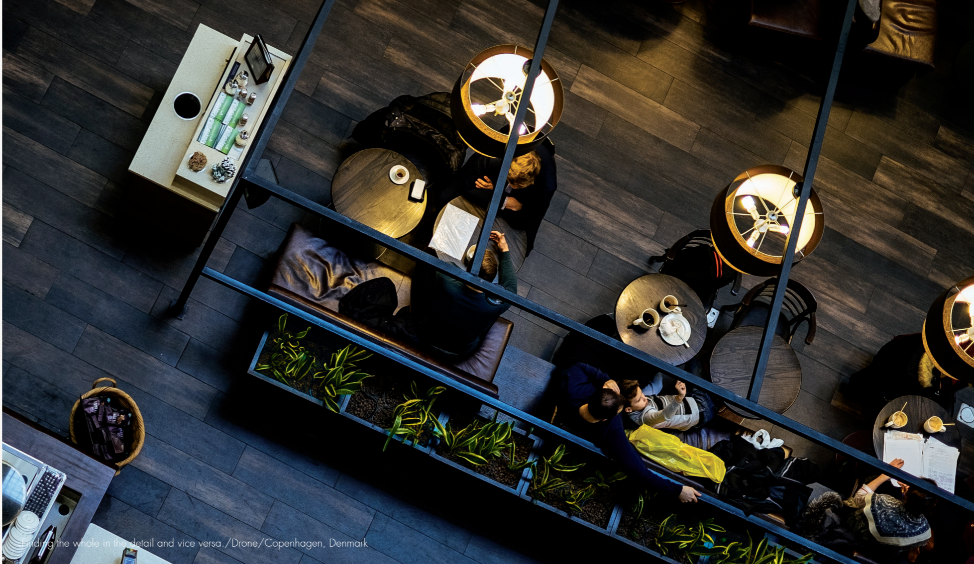
Ending the whole in the detail and vice versa. /Drone/Copenhagen, Denmark