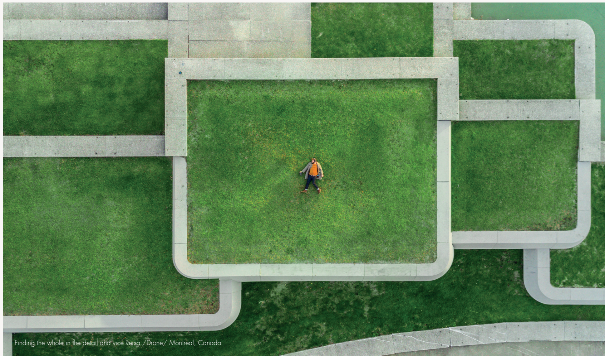
Finding the whole in the detail and vice versa. /Drone/ Montreal, Canada

If you are looking for a professional future that sparks your curiosity and passion, then prepare yourself step by step.